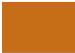
COPPER PENNY (METALLIC COPPER)