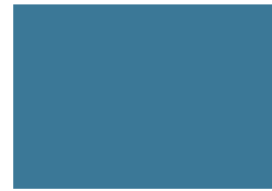
MILITARY BLUE (SLATE BLUE)