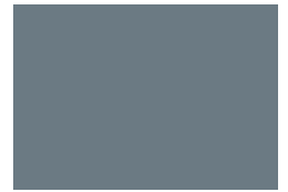
WEATHERED ZINC (PREWEATHERED GALVALUME)