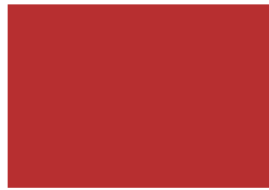
CARDINAL RED* (BRILLIANCE RED)