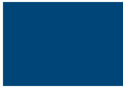
INTERSTATE BLUE* (DEEP BLUE SEA)